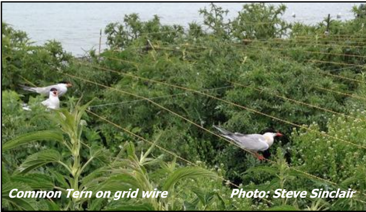
Common Tern on grid wire

After years of little or no productivity due to predation by Black-Crowned Night-Herons and gulls, we developed a modified gull exclusion grid (typically used to keep areas open for tern nesting) that we call a predator exclusion grid (to exclude both types of predator).