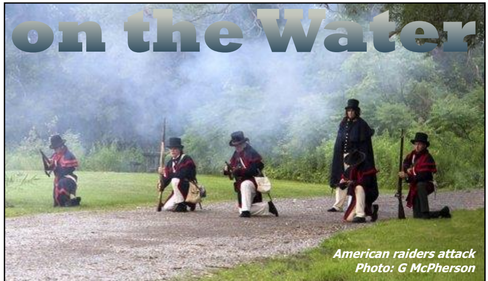
American raiders attack