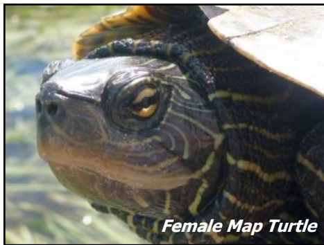
Female Map Turtle

Two types of cement culverts will be used: large box culverts (~1.5 x 2.0 m) designed for reptiles, and smaller culverts specifically designed for amphibians (0.5 x 0.8 m). These culverts will allow safe passage of reptiles and amphibians (as well as all sorts of other small critters) across the road, while 0.8 m-tall fencing will keep them out of harm's way.