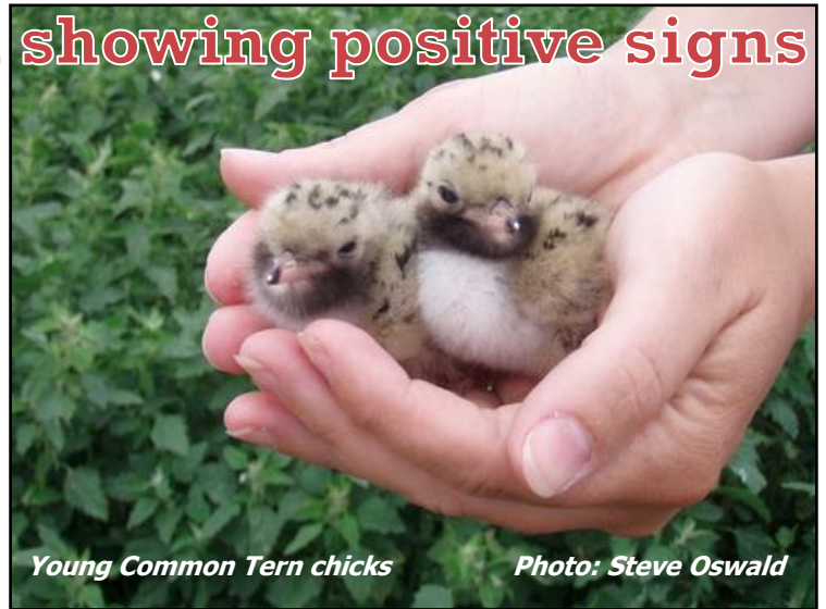
Young Common Tern chicks

Thus, these fledglings will have a high chance of survival during migration. We'll be expecting to see some show up as adults here at Presqu'ile in 2017 and 2018.