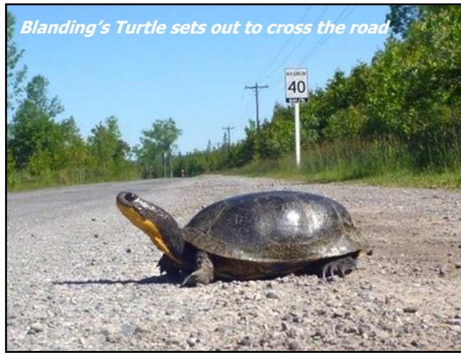
Blanding's Turtle sets out to cross the road

Over the past month, tadpoles have grown some legs, lost their tails, and started moving out of their first wetland and