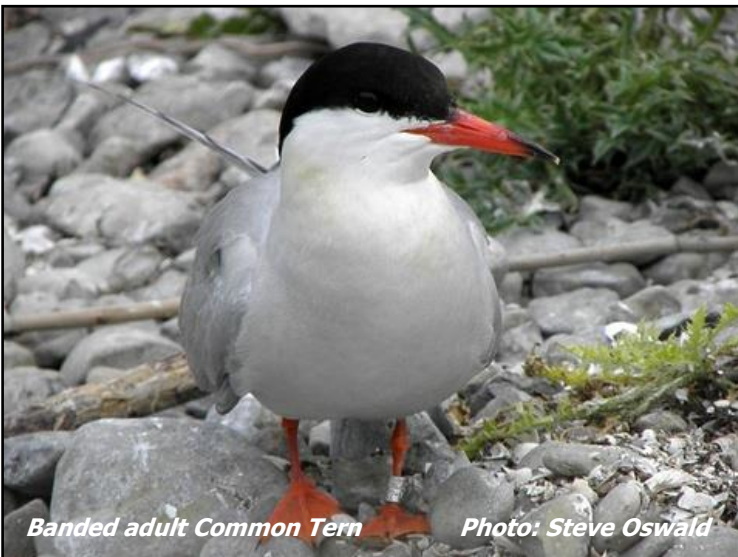
Banded adult Common Tern

The grid was erected after laying in late May/early June and was highly successful. The colony has already fledged large numbers of chicks relative to other years. Also of key importance is that the chicks that have fledged already are fledging at the right time and are offspring of the best parents (parents that lay early in the season and are not exhausted from multiple nesting attempts).